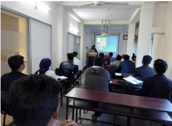
Career Development Course