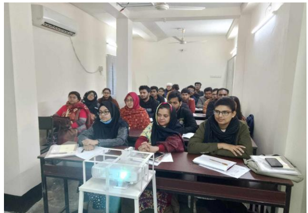
Research Methodology Course